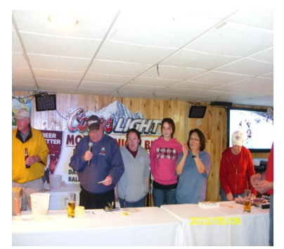
Golfers enjoyed the day including awards, a delicious meal and a chance to win prizes.

had by all. Thanks to all who supported this event as this will help a lot of families in the community.