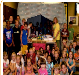
St. Paul's Lutheran Vacation Bible School with school supplies they do donated in August

Thank you to all the individuals, local businesses and churches who contributed to the success of the school supply drive.